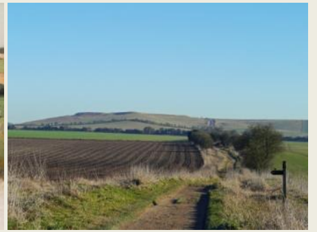
Views of Ridgeway