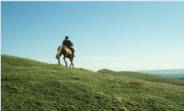
© Countryside Agency Photo: Ann Seth 02-4174

The new Partnership will promote the many-layered appeal of The Ridgeway and will aim to improve links with other nearby attractions.