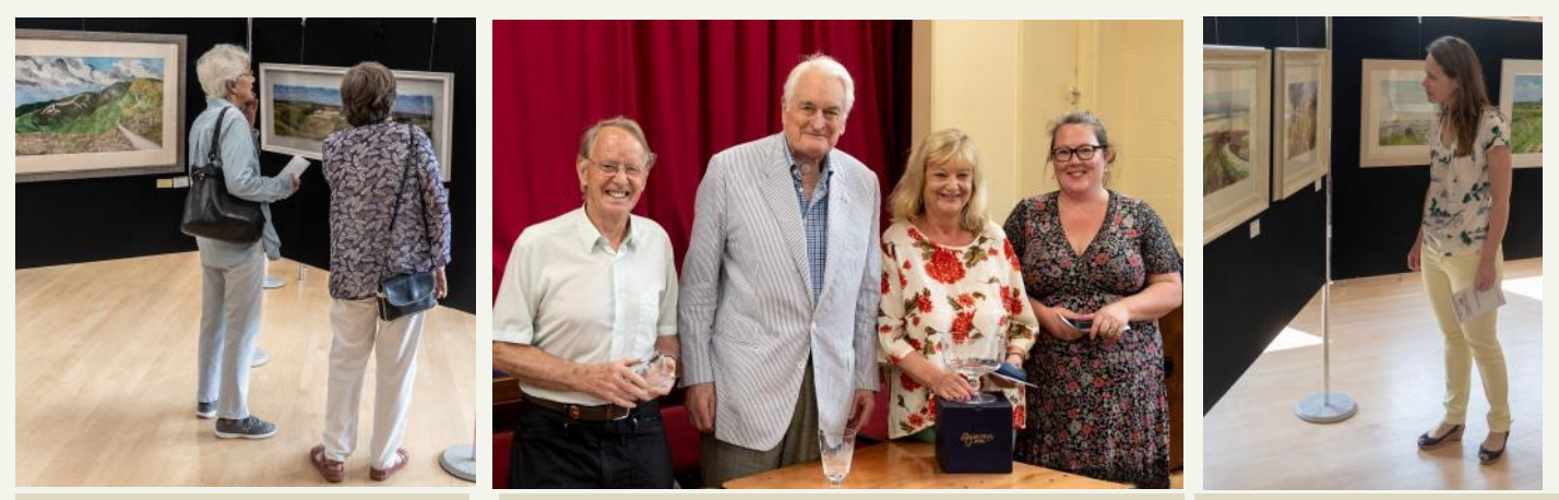
Inspecting textile picture

The 2018 Exhibition and prize giving for the Swire Ridgeway Arts Prize was held over the weekend of Saturday and Sunday 21 - 22 April 2018 in the Thomas Hughes Memorial Hall, Uffington. On Friday there was a Private Viewing for invited guests to meet the artists; guests included the President and Vice President and Committee Members of the Friends of the Ridgeway, representatives of the Ridgeway Partnership, members of the Press and Friends of the Ridgeway Members as well as the artists. Sunday was the Ridgeway Friends Day and Friends of the Ridgeway AGM.